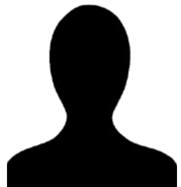
TBD Football Legacy Award