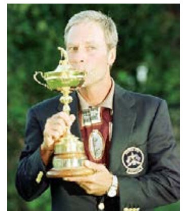
Ben Crenshaw Golf Legacy Award