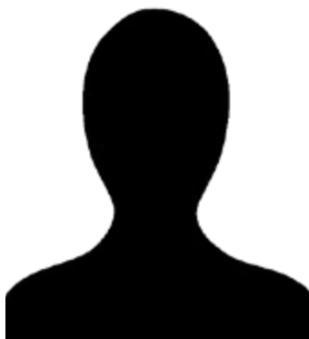
TBD Legacy Award