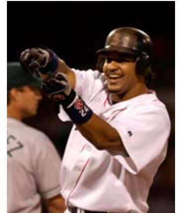
Manny Ramirez Baseball Legacy Award