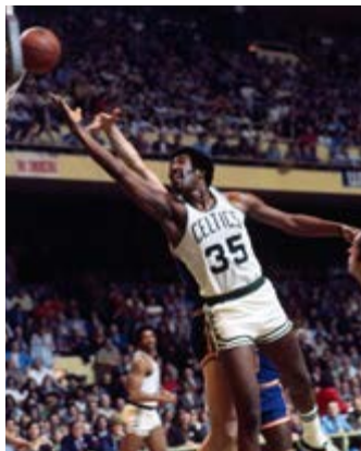
Paul Silas Basketball Legacy Award