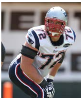
Matt Light Football Legacy Award