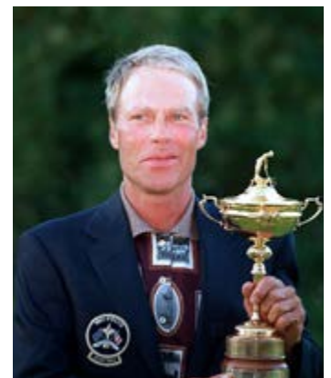
Ben Crenshaw Golf Legacy Award