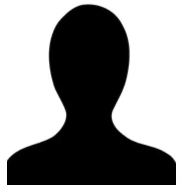
TBD Legacy Award